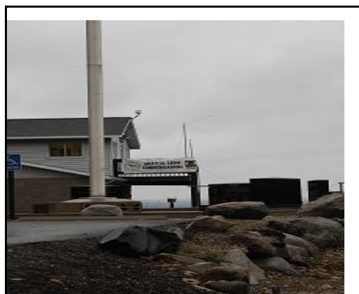
Operating Site: Pine Mountain, Iron Mountain, Michigan